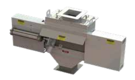
SENTRY GA SAMPLER