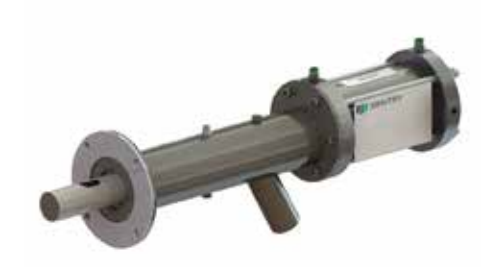
SENTRY PR SAMPLER