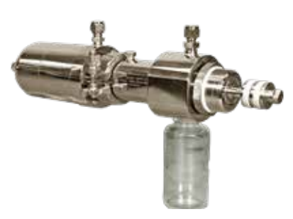
SENTRY ISOLOK SAA SAMPLER