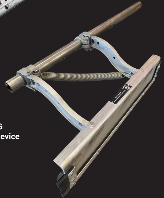
The RSG Skimming Device