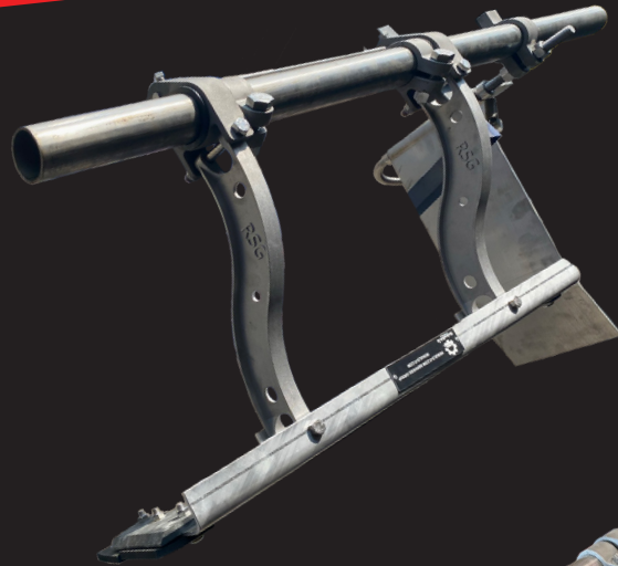
The RSG Hinged Skimming Device