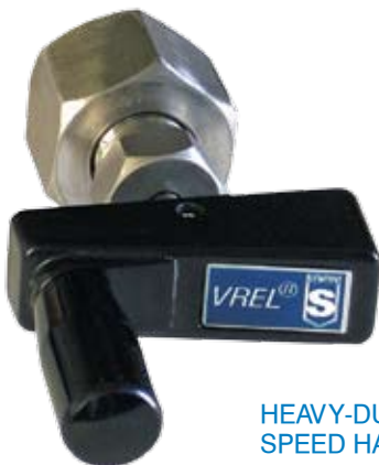
HEAVY-DUTY SPEED HANDLE